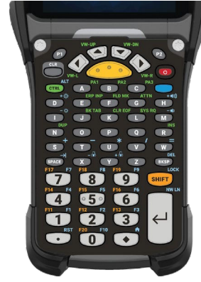
53 Key TE 3270