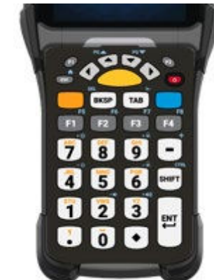
29 Key Function