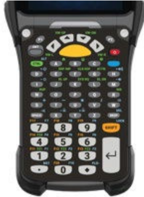
53 Key TE 5250