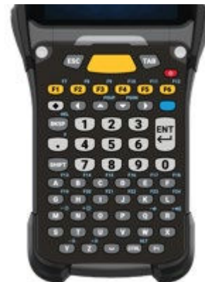
58 Key Func AN