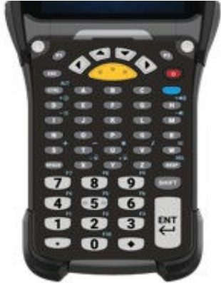
53 Key Standard