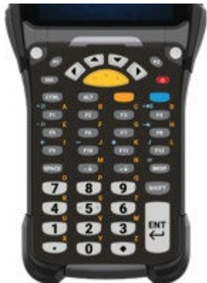
43 Key Function