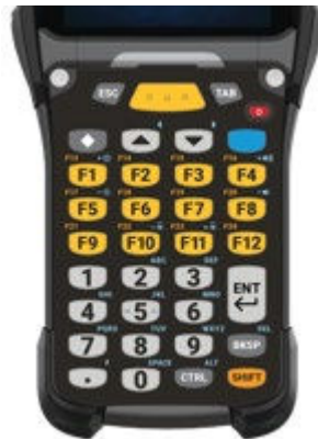
34 Key Function