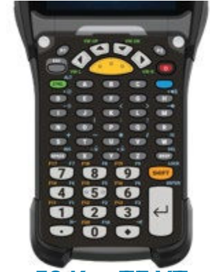
53 Key TE VT