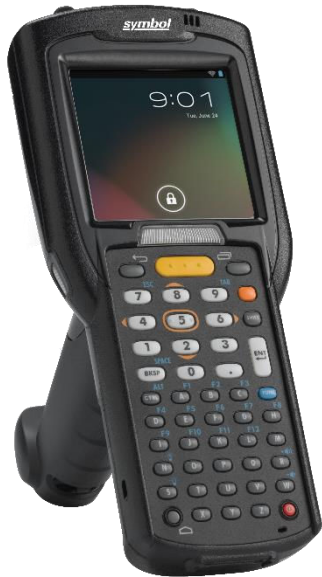
Android 4.1 Jelly Bean