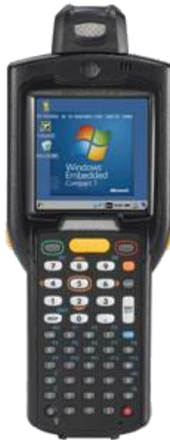
Microsoft Windows Embedded Compact 7.0