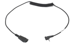
25-124411-03R Headset adapter cable