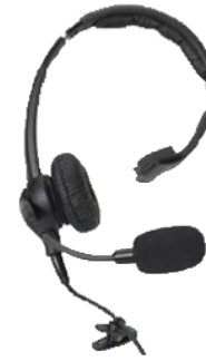
RCH51 Rugged Wired Headset