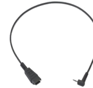
25-124389-01R Headset adapter