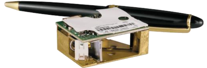
SE965 1D Standard Range Scan Engine

SE4750 1D/2D Standard Range Array Imager