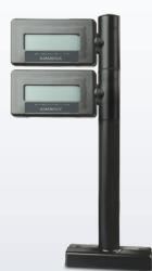
90ACC0343 Dual Display/ Single Interval