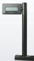
90ACC0340 Single Display/ Single Interval