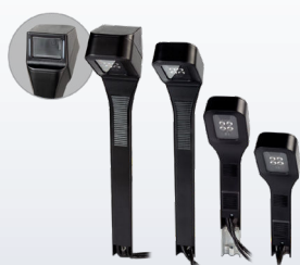
90ACC0419 Top Down Reader (TDR) 31.5 cm / 12.4 in 90ACC0418 Top Down Reader (TDR) 22.8 cm / 9.0 in 90ACC0417 Top Down Reader (TDR) 17.8 cm / 7.0 in Top Down Reader with Customer Facing Reader also available