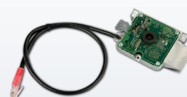
Smart Color Cameras (coming soon)