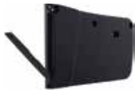
RT10-CAC - AVAILABLE IN US AND EUROPE ONLY