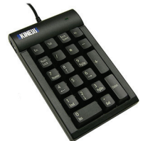
Low Force Keypad AC210USB-blk