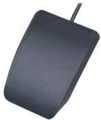
Single Foot Pedal FS007RJ11